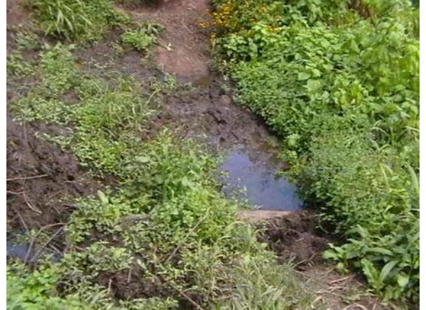
Right: Original water source during dry season

Clean Water System: WFA funded the very first clean water project in Liwan in 2008. This was life changing as previously the only nearby water source was a muddy small creek which was soiled by oxen and people walking through it and washing. Dysentery is a significant cause of death and illness, especially for the children and elderly. The gravity water system was pipes collecting water from a waterfall high up in the hills. However, over the years the pipes clogged up due to the narrow diameter of the pipes. Although, repairs were done, it now requires an upgraded replacement. We are seeking donations to assist in this, with the local contractors having learned lessons of what is best after the earlier efforts. We are so grateful for Judy's bequeath providing a starting fund for this, but still need to raise $15,500 . As it is the dry season it is the very best time to do this work. All donations gratefully received, whether small or large, and are tax deductible .