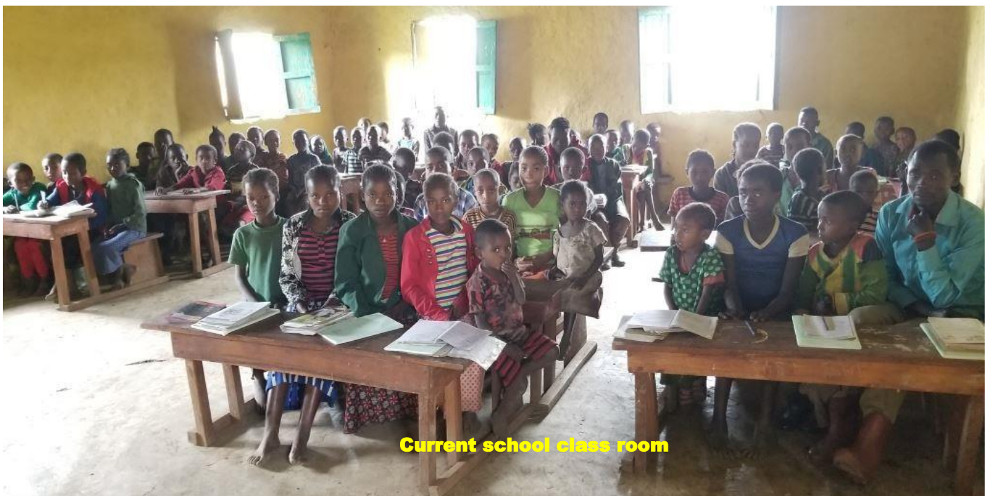
Current school class room