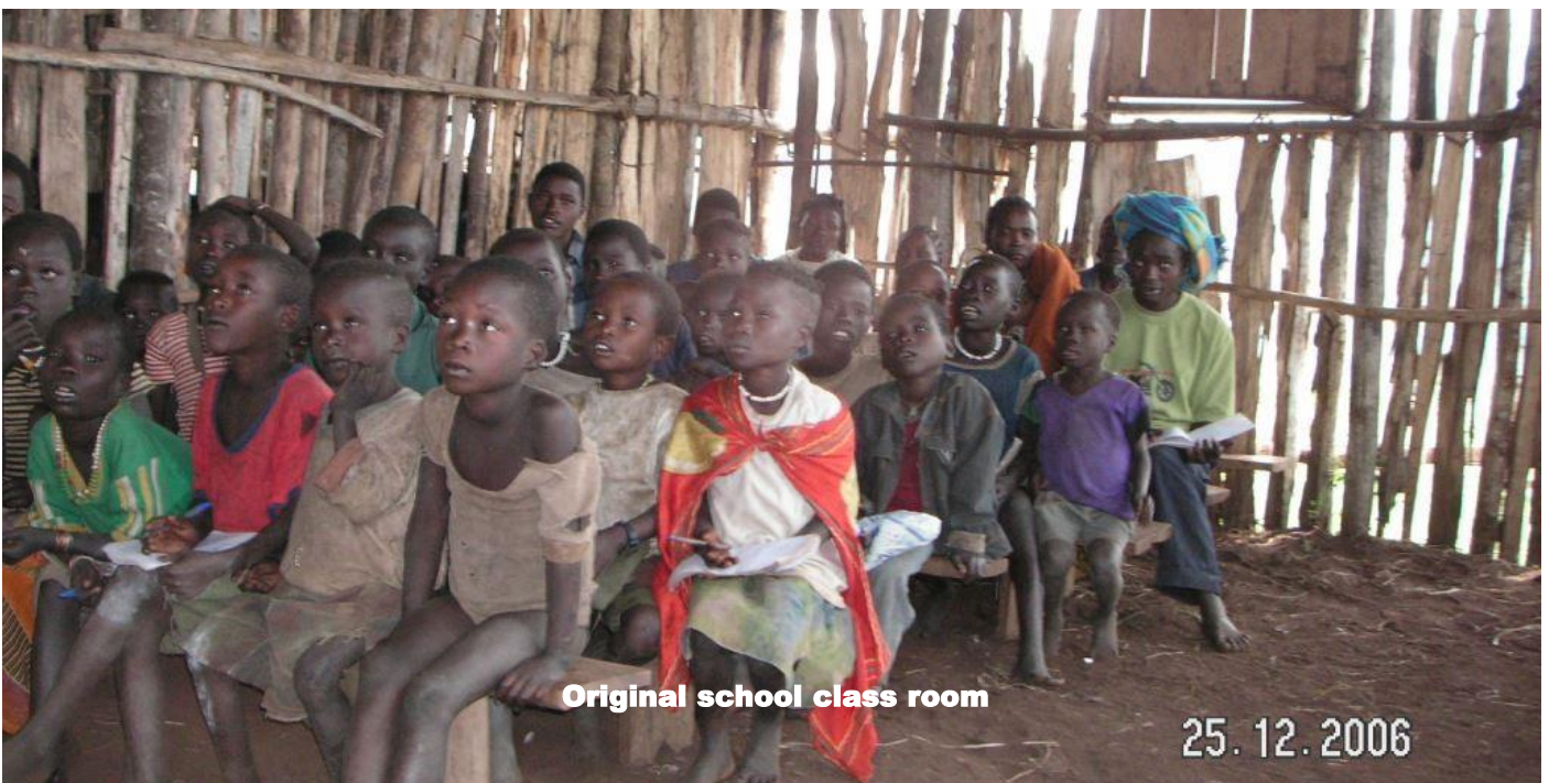
Original school class room

Clean Water System: WFA funded the very first clean water project in Liwan in 2008. This was life changing as previously the only nearby water source was a muddy small creek which was soiled by oxen and people walking through it and washing. Dysentery is a significant cause of death and illness, especially for the children and elderly. The gravity water system was pipes collecting water from a waterfall high up in the hills. However, over the years the pipes clogged up due to the narrow diameter of the pipes. Although, repairs were done, it now requires an upgraded replacement. We are seeking donations to assist in this, with the local contractors having learned lessons of what is best after the earlier efforts. We are so grateful for Judy's bequeath providing a starting fund for this, but still need to raise $15,500 . As it is the dry season it is the very best time to do this work. All donations gratefully received, whether small or large, and are tax deductible .