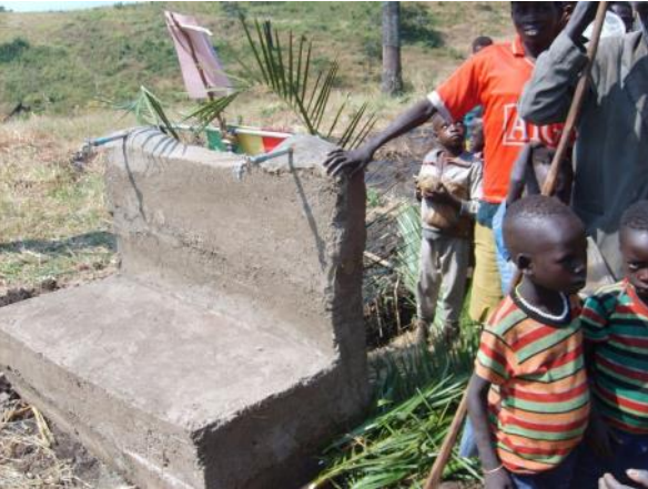
Left: The gravity water system that needs replacing.

WFA received a generous bequeath from a long-time supporter, Judy Morris. Judy supported a number of Ethiopian children and knitted a ton of beanies, baby clothes and blankets over the years for us to take to various projects. I took many of them to Liwan, as well as to other projects. Judy's fund is being spread across numerous projects in various countries. In Liwan it is being used in 3 areas: 1) completing the village latrines, 2) completing the Teachers Residence, and 3) towards replacing the now defunct gravity-fed clean water system.