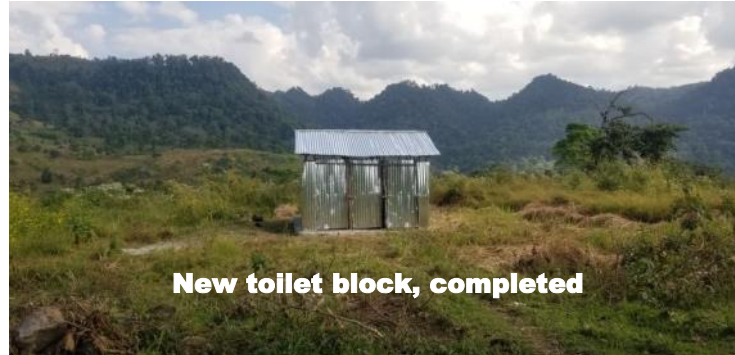
New toilet block, completed

The School Latrines are now completed and I have attached a photo (see below). The latrines, built in 2008, have long filled up and were no longer useable. Lack of sanitation is the biggest cause of dysentery and a primary cause of death in children in Ethiopia. We hope over time the community will be interested in building latrines for their homes with the children learning about the importance of sanitation at school.