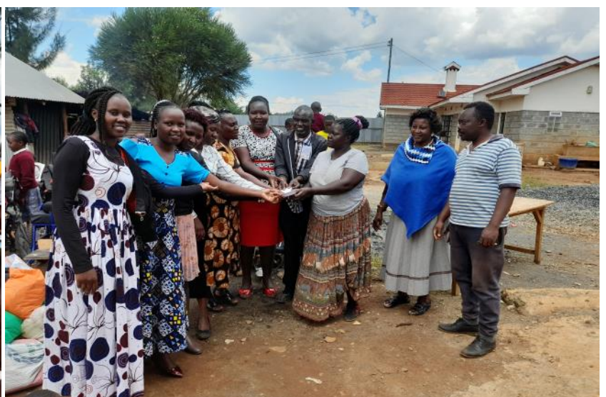
As a requirement by the government, the new education system requires that learners visit the less fortunate in the society with donations. Here, Neema School Grade 3 and their teachers visited a nearby home for the mentally challenged.