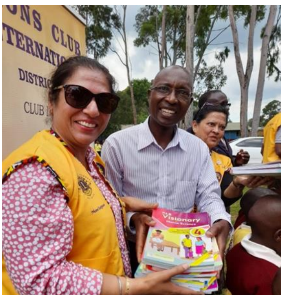
Receiving text books from one of the printing companies through the Eldoret Lions Club.