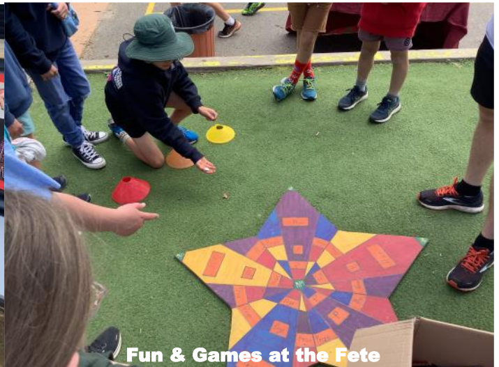
Fun & Games at the Fete

The Catholic Church celebrates Mission Week in schools every year. Traditionally Catholic schools, including Our Lady Star of the Sea, Victoria; have supported the work of the Catholic Missions through fundraising. This money has assisted lives in the poorest communities throughout the world. In 2013, one of our then Year 3 students returned to Ethiopia to meet her birth mother. She had been adopted as a baby because her birth mother was too poor to care for her.