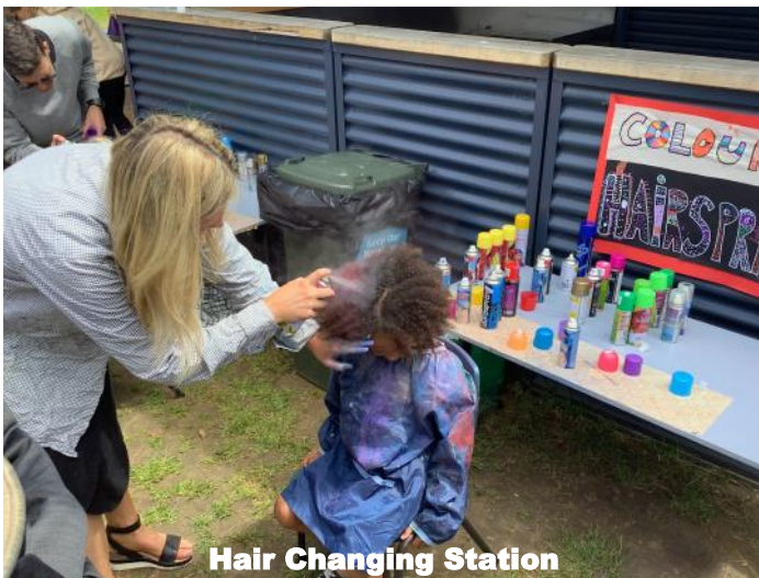
Hair Changing Station