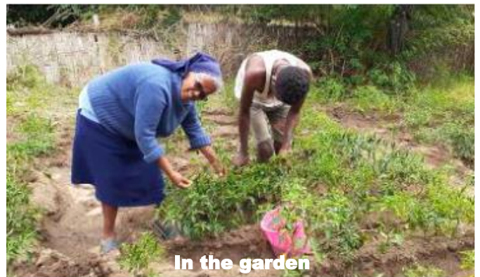
In the garden