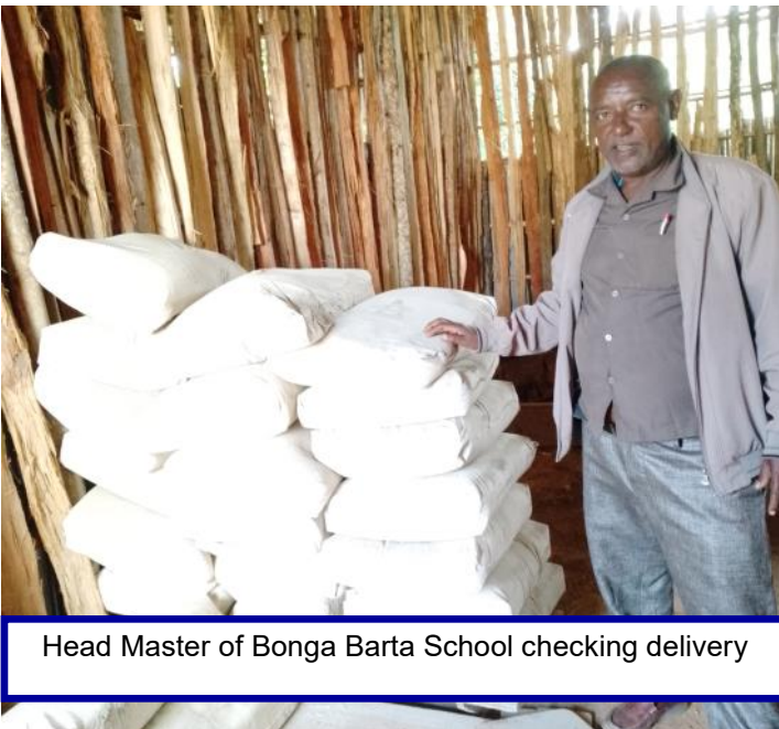
Head Master of Bonga Barta School checking delivery