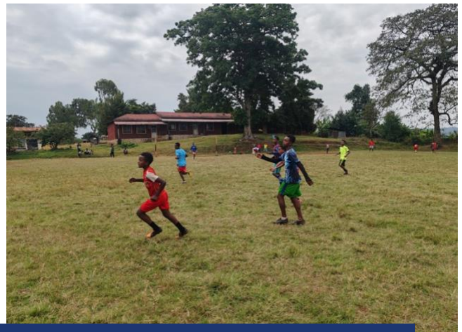
Bonga Barta Soccer Team at the Soccer Pitch in the kits donated by sponsors